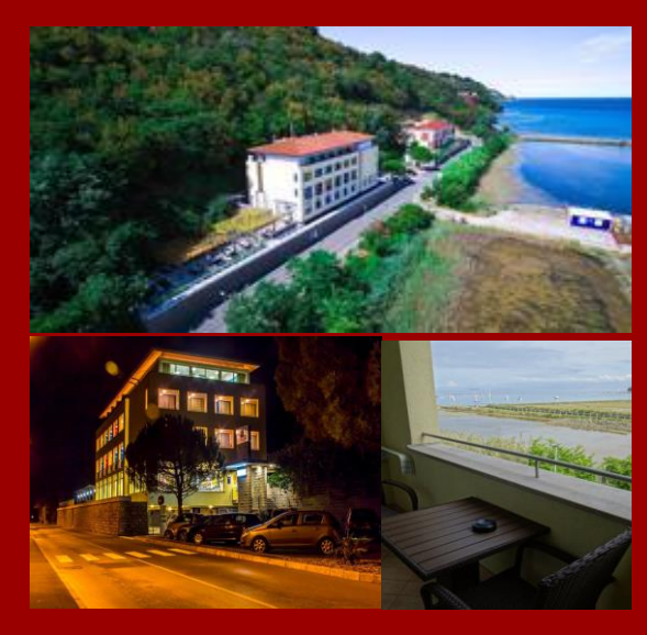
Lectures will take place in the Conference room of Hotel Oleander in Strunjan, on Slovenian coast (http://en.oleander.si/).

Now is time to apply and save 1.009,50€! Only until 29th of November, 2018! APPLY NOW!