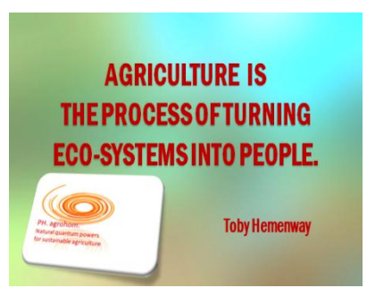
<u>https://lnkd.in/dxkbFKT</u> PHENIX agronatural™