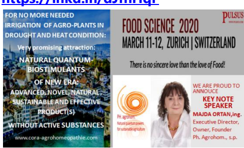
Postpone due to coronavirus pandemic.